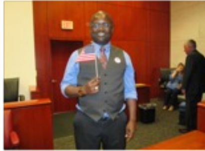
A new United States citizen given an American flag by TCDAR