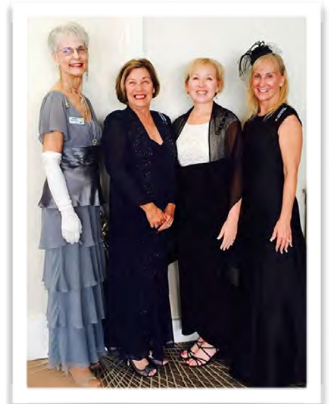
Tampa Chapter, NSDAR