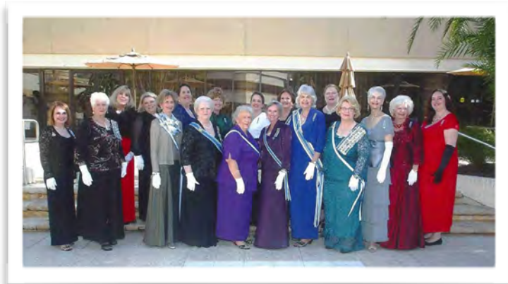
2015 Officers and Honoraries