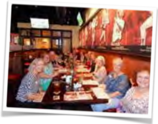
Tampa Chapter, DAR enjoys a lunch outing after every meeting! Come join the fun!

Tampa Chapter, DAR enjoyed seeing many new faces at our September meeting!