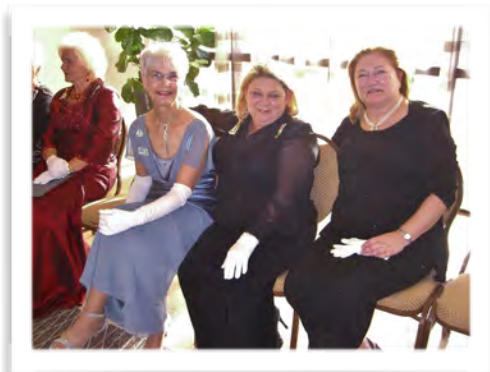
2015 Saturday Night Line-Up